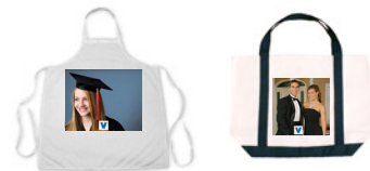
Gifts - Aprons, Tote Bags, T-shirts Mugs, Mousepads and much more