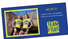
Cards - Folded, Greeting and Flat