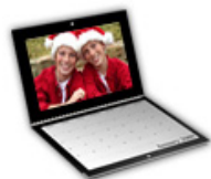
Photo Calendars and Photo Books