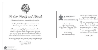
Wedding and Occasion Favors