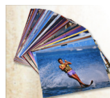
Prints and Clings